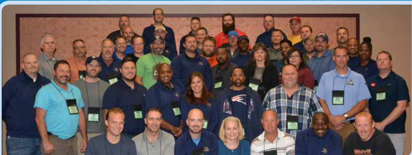
FALL CLASS OF 2020