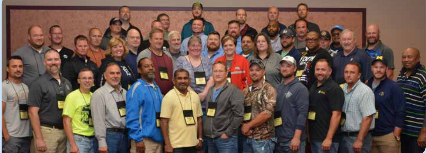
FALL CLASS OF 2019