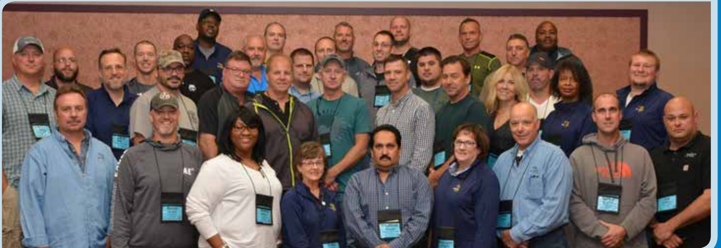
FALL CLASS OF 2018

Comfort Inn Conference Center | Mt. Pleasant, MI