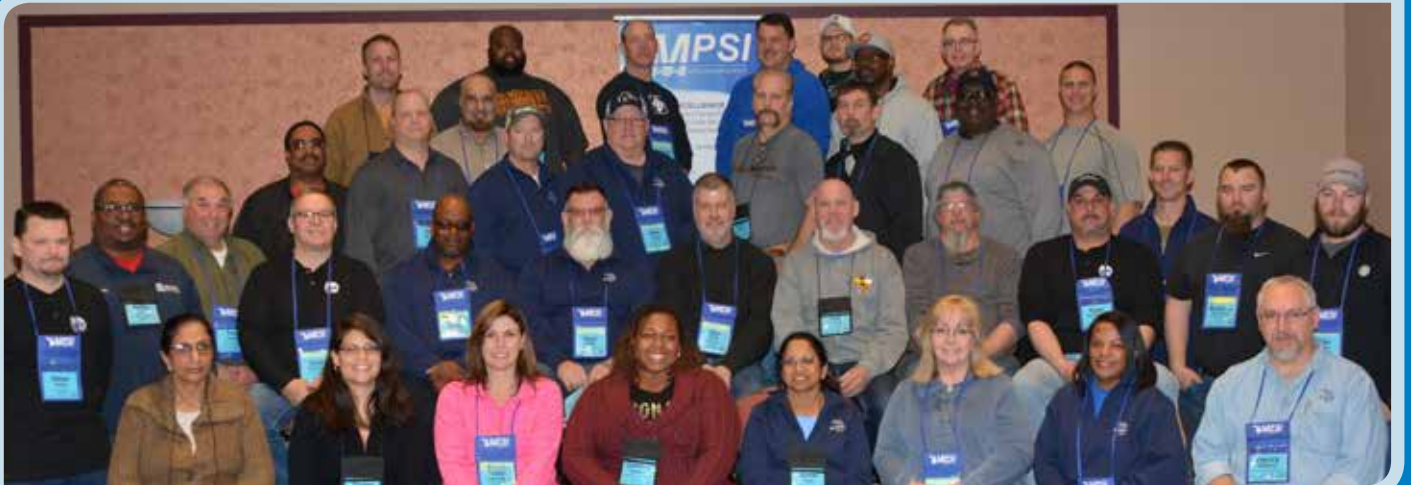
SPRING CLASS OF 2018

Comfort Inn Conference Center | Mt. Pleasant, MI