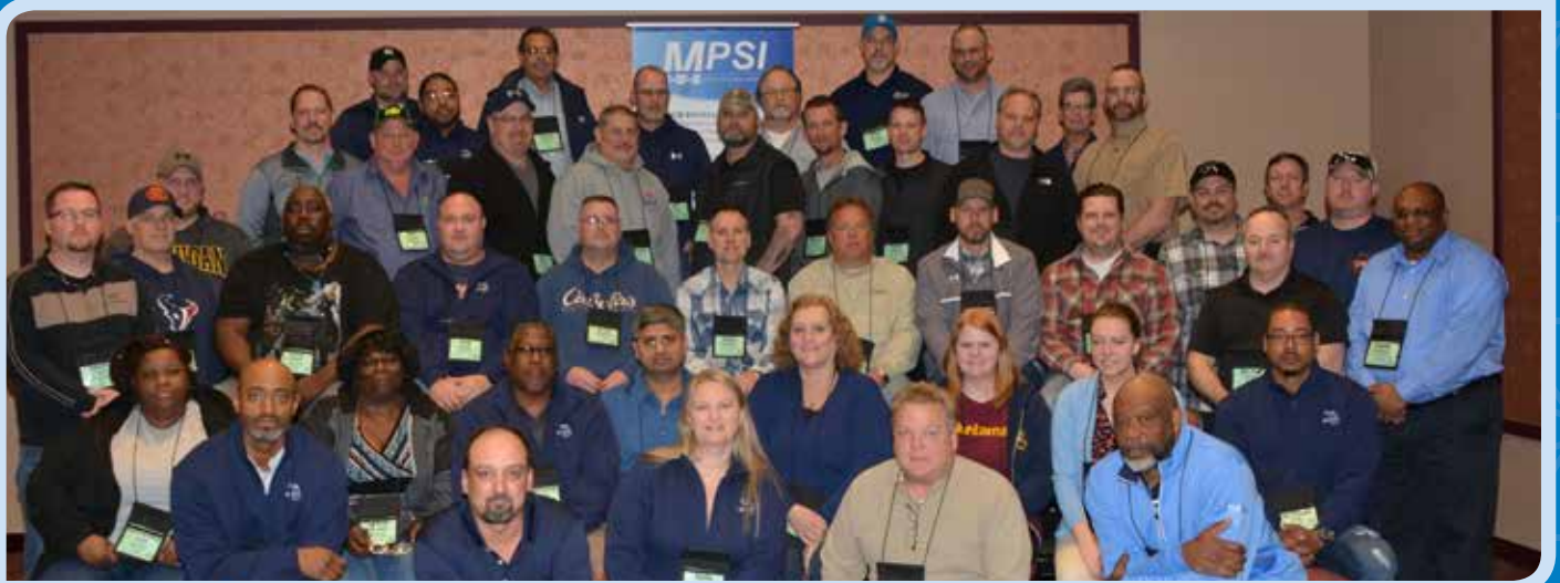
SPRING CLASS OF 2020