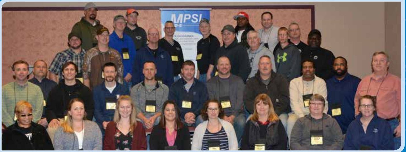
SPRING CLASS OF 2019