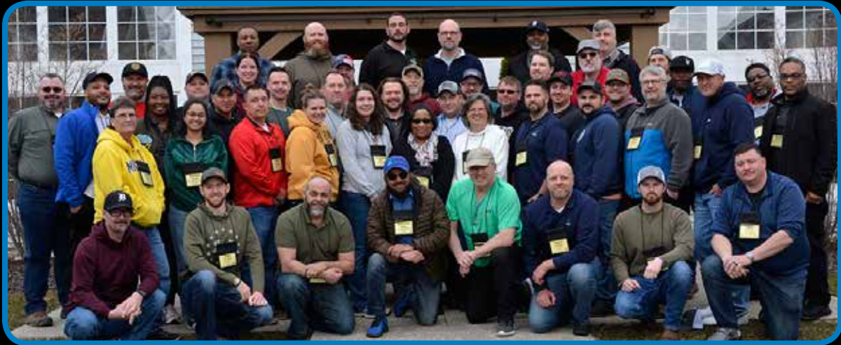
SPRING CLASS OF 2024