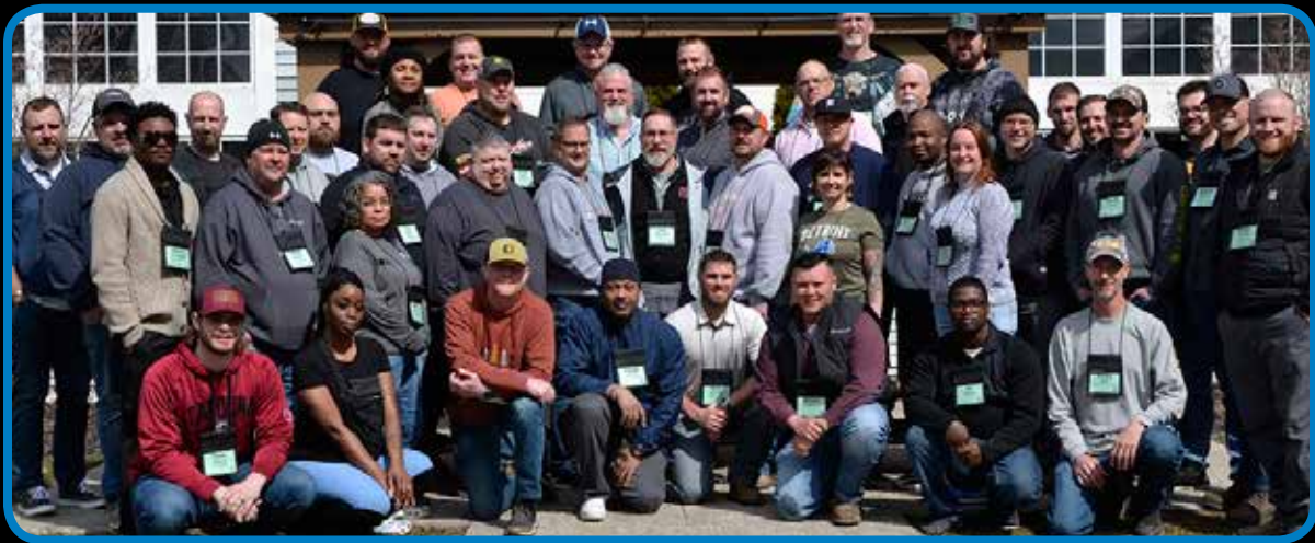
SPRING CLASS OF 2025