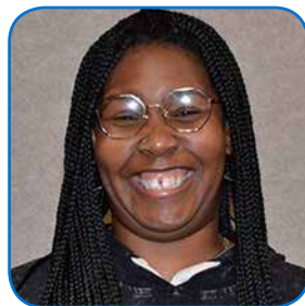
EVITA PARKS GLWA Year 2